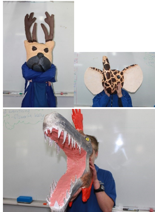
Junior Visual art work