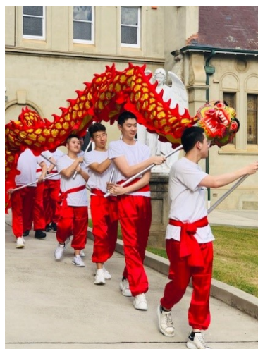
Lunar New Year