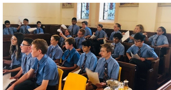
Choir in Mass

The study of Mandarin in the junior school Year 7-10 continues to be highly successful.