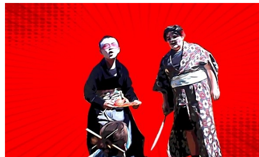
Japanese student theatre