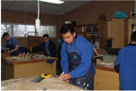
Design & Technology