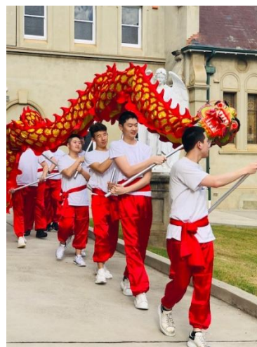
Lunar New Year 2019