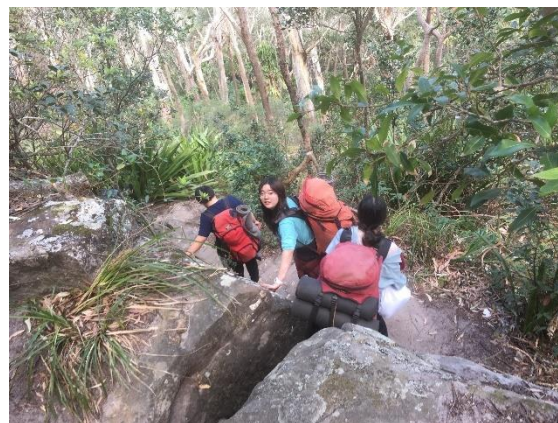
Duke of Edinburgh 2019

The Religion Studies program aims to look at the holistic, spiritual education of each student. It also aims to meet the ESL language requirements for the international students.