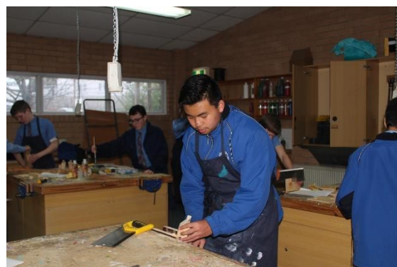
Design & Technology