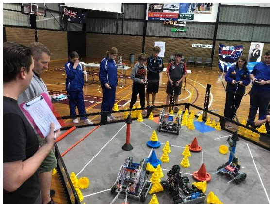
Robotics competition 2019

Due to Covid -19 activities for science were put on hold. We look forward to a better 2021 and more exciting experiments and trips. Our scope for online learning increased and we have found digital ways to communicate the joy and interest in science!