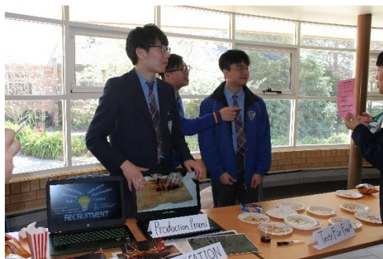
Entrepreneurs Cup 2019

Due to Covid-19 soccer, basketball and tennis were on hold. We look forward to offering them again next year.