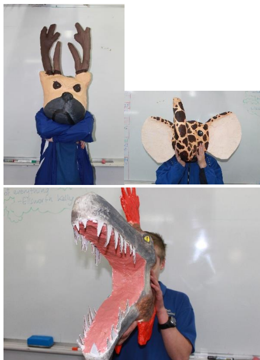
Junior Visual art work 2019