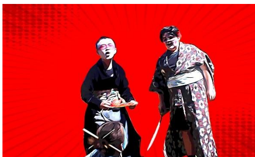
Japanese student theatre 2019