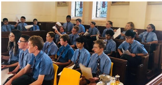
Choir in Mass 2019