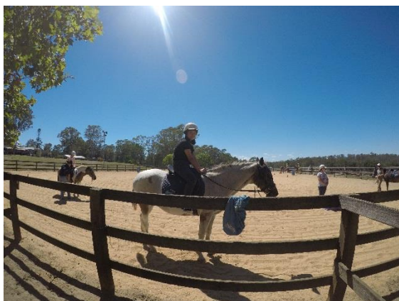
Teen Ranch 2019

activity and making healthy and wise decisions. Through PDHPE, young people learn to take a positive approach to managing their lives and it equips them with the skills for current and future challenges.